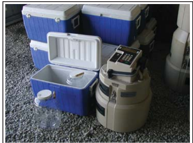
Water bottles (sample above) are collected from samplers after rainfall events for analysis.

One major objective of the WRASP project was to discover which Best Management Practices (BMPs) had the greatest impact on improving water quality while maintaining farm profitability. Different BMPs apply to different