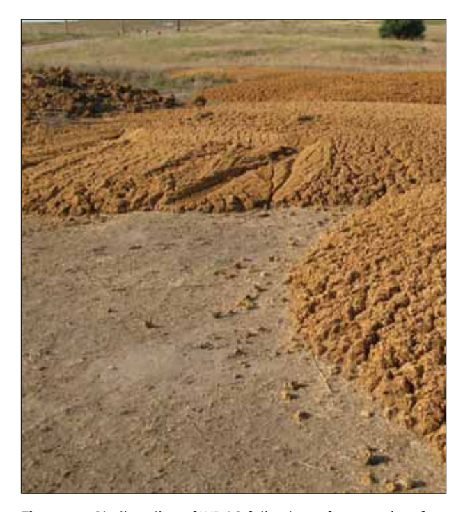
Figure 19. Similar piles of WDGS following a few months of storage while exposed at the surface.

performance between DDGS, WDGS and a 67% WDGS and 33% ground wheat straw mixture (DM basis) stored in bags for 30 days prior to initiation of the trial. Steers were supplemented one of four levels of co-product: 0.0, 2.0, 4.0 or 6.0 lb. of distillers grains daily. The base diet consisted of 60% sorghum silage and 40% alfalfa hay with supplement top-dressed. Gain increased linearly with increasing levels of co-product supplementation (1.52 to 2.62 lb./day). Steers supplemented the mixture had lower dry matter intake (DMI) compared to DDGS and WDGS (P=0.05) because of the straw; however, feed conversion was not reduced. In Exp. 4, 96 steers were used to determine palatability of WDGS mixed with wheat straw. Steers were fed either 50% WDGS and 50% wheat straw mix, or 60% WDGS and 40% wheat straw mix. A base diet containing 60% sorghum silage and 40% alfalfa hay was also fed either simultaneously or a minimum of four hours post feeding the assigned level of WDGS and wheat straw mix. Calves fed 60% WDGS gained more than calves fed 50% WDGS