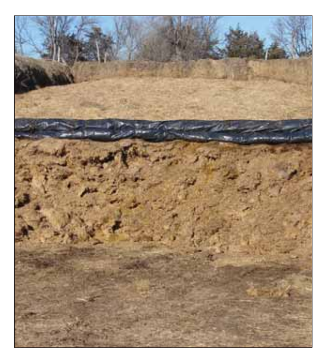
Figure 10. Grass hay and modified WDGS (45% DM) mixed in a bunker made of round bales, covered in plastic and ground hay. Mixture is 15% grass hay and 85% modified WDGS (DM basis).

Neb. The mixtures used were 20% wheat straw and 80% WDGS (as-is basis) for both years. Assuming the WDGS is 35% DM and the wheat straw is 90% DM, this equates to approximately a ratio of 39% wheat straw and 61% WDGS on a DM basis. In year 1 (Figure 8), the pile was covered and bales were used for sides. In year 2 (Figure 9), the pile was larger and, again, covered in plastic with bales used for sides.