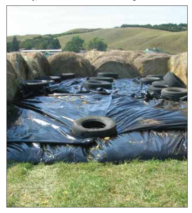
Figure 14. WDGS piled and covered in the same bunker as Figure 13.