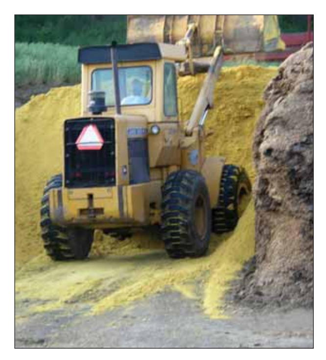
Figure 16. Piling modified WDGS (42-50% DM) straight in a bunker.

Modified WDGS that is 42-50% DM and WCGF that is either 45% or 60% DM does pile and may be stored in a bunker by itself without forage added. However, the pile cannot be compacted by driving equipment onto the feed in a bunker. There are numerous examples of producers that have piled and covered either WCGF or MWDGS and had little spoilage (except on the top surface as would be expected). In Figure 16, piling of MWDGS appears to work in either earthen bunkers or concrete bunkers. We would always recommend covering with plastic or some mechanism to minimize spoilage at the surface. This storage method of just piling either MWDGS or WCGF is "riskier" in terms of spoilage