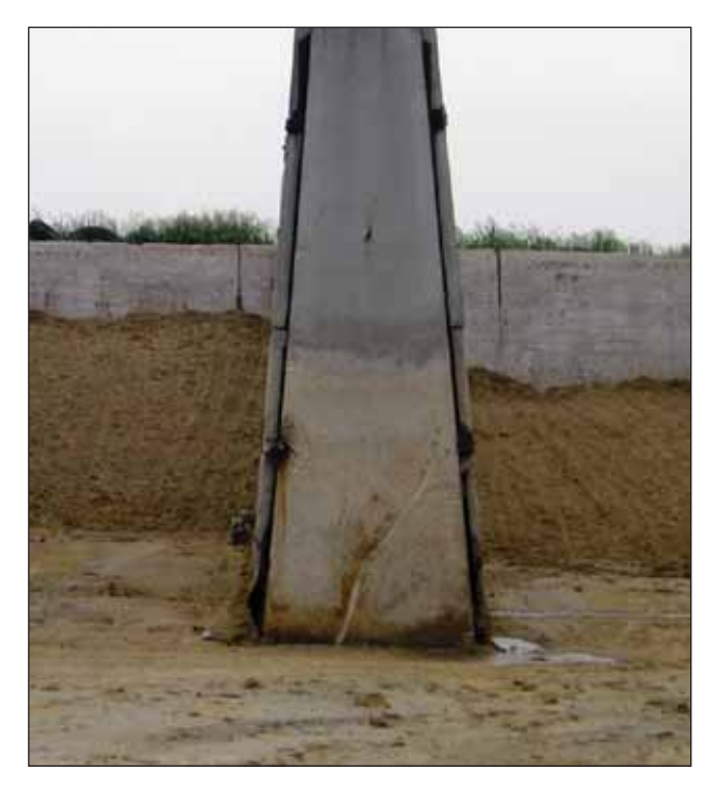
Figure 7. Initial bunker tests with 70% WDGS and 30% grass hay (on the right) and 60% WDGS and 40% grass (on the left). Mixtures are on a DM basis.