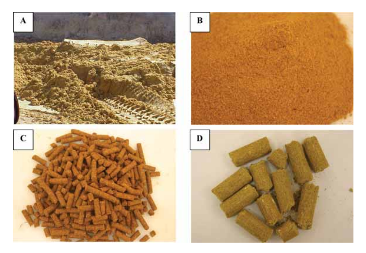
Figure 1. Different forms of distillers grains: A. WDGS (approximately 35% DM), B. DDGS in a meal form (90% DM), C. DDGS in a pelleted form (3/8 in. pellet, 90% DM, approximately 96% DDGS) and D. DDGS in a cube form (3/4 in. cubes, 90% DM, approximately 70% DDGS).

Three types of distillers grains can be produced that vary in moisture content. Ethanol plants may dry some or all of their distillers grains to produce dry distillers grains plus solubles (DDGS; 90% dry matter [DM]). However, many plants that have a market for wet distillers locally (i.e., Nebraska) may choose not to dry their distillers grains due to cost advantages. Wet distillers grains plus solubles (WDGS) is 30-35% DM. Modified wet distillers grains plus solubles (MWDGS) is 42-50% DM. It is important to note that plants may vary from one another in DM percentage, and may vary both within and across days for the moisture (i.e., DM) percentage. Figure 1 depicts different forms of distillers grains that may be used by beef producers. There are advantages and disadvantages to each of these feeds.