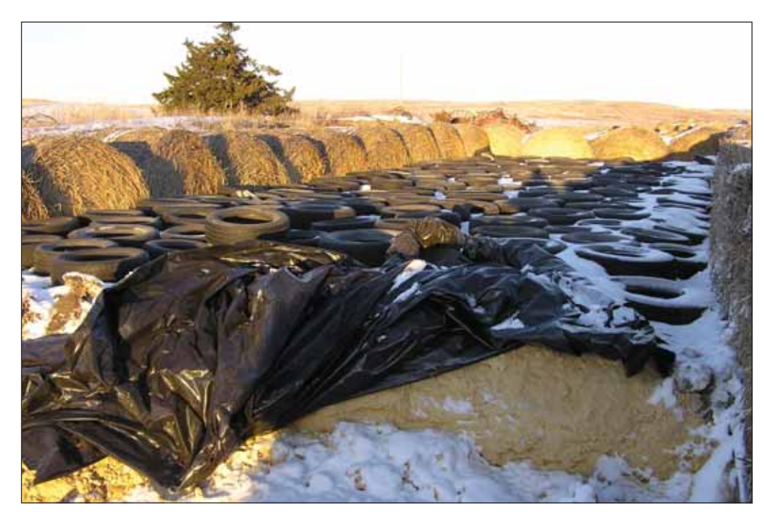
Figure 17. WDG (without solubles) stored straight in a bunker lined with plastic and round bales. The pile was treated on the surface with 1 lb. of stock salt per square foot then covered in plastic.

to handle 1 or 2 semi-loads. Therefore, purchasing large quantities (much more than 2 semi-loads) may not be feasible if the solubles are handled as a liquid. Handling distillers solubles brings challenges inherit in all liquid feeds such as equipment and pumps, circulation of the liquid to ensure that "settling" does not occur or separation and the potential for freezing in cold temperatures. Therefore, one option that may be possible is to store distillers solubles mixed with forages in either bags or bunkers. This may allow producers to purchase large quantities and store them for later use, regardless of temperature.