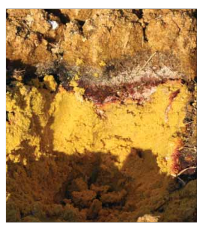
Figure 20. Piled and stored WDGS illustrating drying out at the surface and mold growth on the top few inches.

performance between DDGS, WDGS and a 67% WDGS and 33% ground wheat straw mixture (DM basis) stored in bags for 30 days prior to initiation of the trial. Steers were supplemented one of four levels of co-product: 0.0, 2.0, 4.0 or 6.0 lb. of distillers grains daily. The base diet consisted of 60% sorghum silage and 40% alfalfa hay with supplement top-dressed. Gain increased linearly with increasing levels of co-product supplementation (1.52 to 2.62 lb./day). Steers supplemented the mixture had lower dry matter intake (DMI) compared to DDGS and WDGS (P=0.05) because of the straw; however, feed conversion was not reduced. In Exp. 4, 96 steers were used to determine palatability of WDGS mixed with wheat straw. Steers were fed either 50% WDGS and 50% wheat straw mix, or 60% WDGS and 40% wheat straw mix. A base diet containing 60% sorghum silage and 40% alfalfa hay was also fed either simultaneously or a minimum of four hours post feeding the assigned level of WDGS and wheat straw mix. Calves fed 60% WDGS gained more than calves fed 50% WDGS