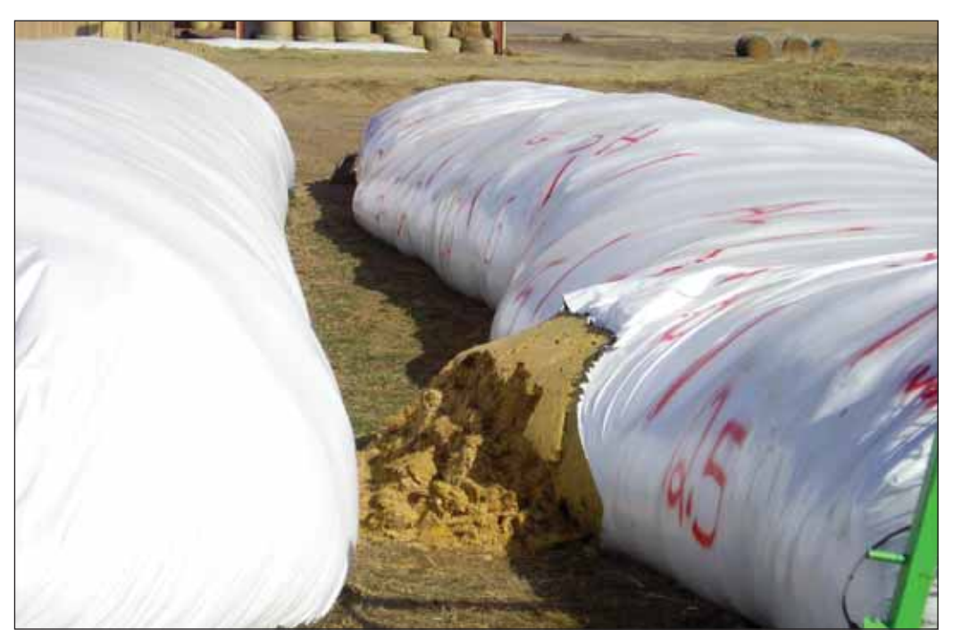
Figure 5. Bagging WDGS with experimental mixtures of different forages and amounts of forage. This picture illustrates the different height and width of silo bags depending on forage or dry feed added. We evaluated the lower limits required and did break the bag when too little forage was added.

Table 1 provides example calculations for determining the mixture on an as-is basis from the mixture provided on a DM basis, along with the DM of each ingredient.