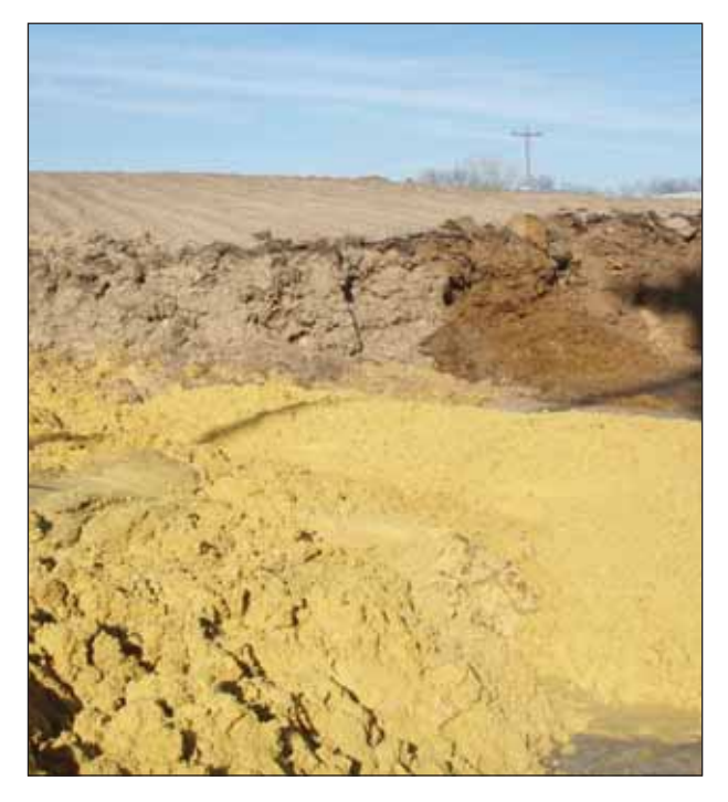
Figure 12. Concrete bunker with 85% WDGS and 15% wheat straw (as-is). The straw was ground through a 1-in. screen. In the foreground is straight WDGS being fed fresh. The bunker contains 9,000 tons of WDGS all mixed through vertical mixers.