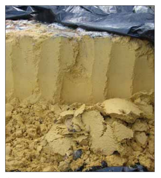
Figure 15. WDGS piled and covered in the same bunker as Figure 13 illustrating a small layer of spoilage across the surface, but little change within the pile.