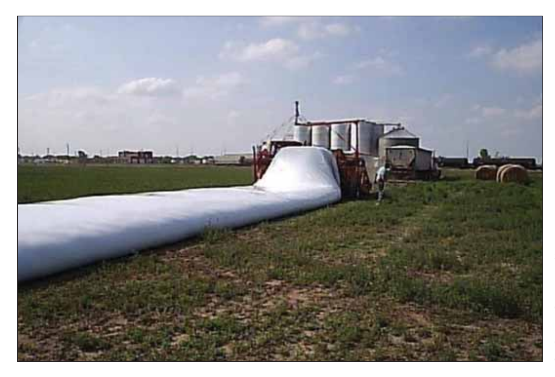
Figure 3. Bagging straight WDGS with no pressure. WDGS can be bagged with no forages or other feeds added; however, the bagger cannot apply pressure during bagging.

The main challenge with storage of WDGS (35% DM, 65% moisture) is that the material is not able to be compacted during storage. Therefore, bulking agents are needed to either dry the material, to add bulk or both. Dry forages are the most logical source to add bulk to WDGS. However, other dry feeds may be used. Modified WDGS and WCGF appear to have enough bulk to be able to store in silo bags under pressure (300 psi or greater). It should be noted that WDGS (35% DM) can be stored in silo bags under no pressure with little risk of splitting bags (Figure 3). However, this storage method is less efficient in terms of storage area and use of bags and may allow for some air pockets with no pressure added to the bag.