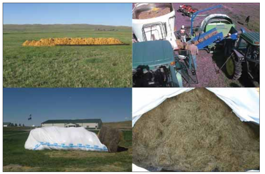
Figure 6. WDGS piled on a meadow in the Nebraska Sandhills, and mixed with 56% grass hay (DM basis) using a vertical mixer that bales were loaded directly into. Storage worked well and the mixture was supplemented to grazing cows.

We initially mixed 30% grass hay with 70% WDGS (DM basis) and packed with a skid loader with rubber tracks. This mixture worked fine and compacted; however, the weight of a pay loader was not maintained on the pile. A bunker with 40% grass hay with 60% WDGS (DM basis) did compact in the bunker and yet maintained the weight of a pay loader (Figure 7). Similar to bagging, forage sources can likely be exchanged on an equal fiber (i.e., NDF) basis. For example, 29% corn stalks was successfully stored with 71% WDGS in a