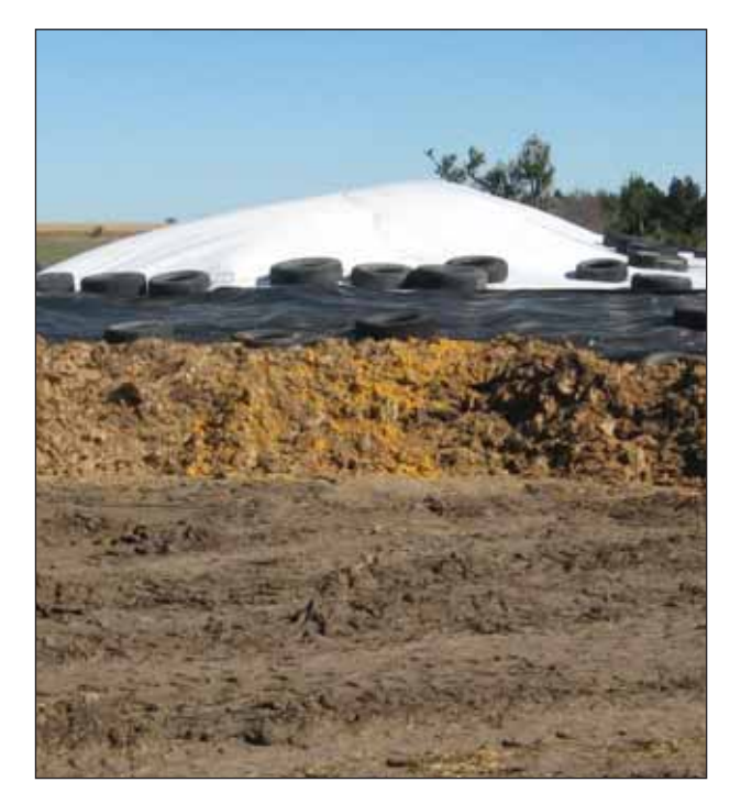
Figure 9. Same producer with a similar mixture as Figure 8 from the second year. The mixture was 20% wheat straw and 80% WDGS (as-is basis), which is 38-40% straw on a DM basis.

bunker with little spoilage. In this example, dry cows were fed this mixture in a dry lot situation.