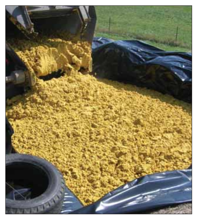
Figure 13. Piling WDGS (30-35% DM) and covering in a bunker made of round bales.