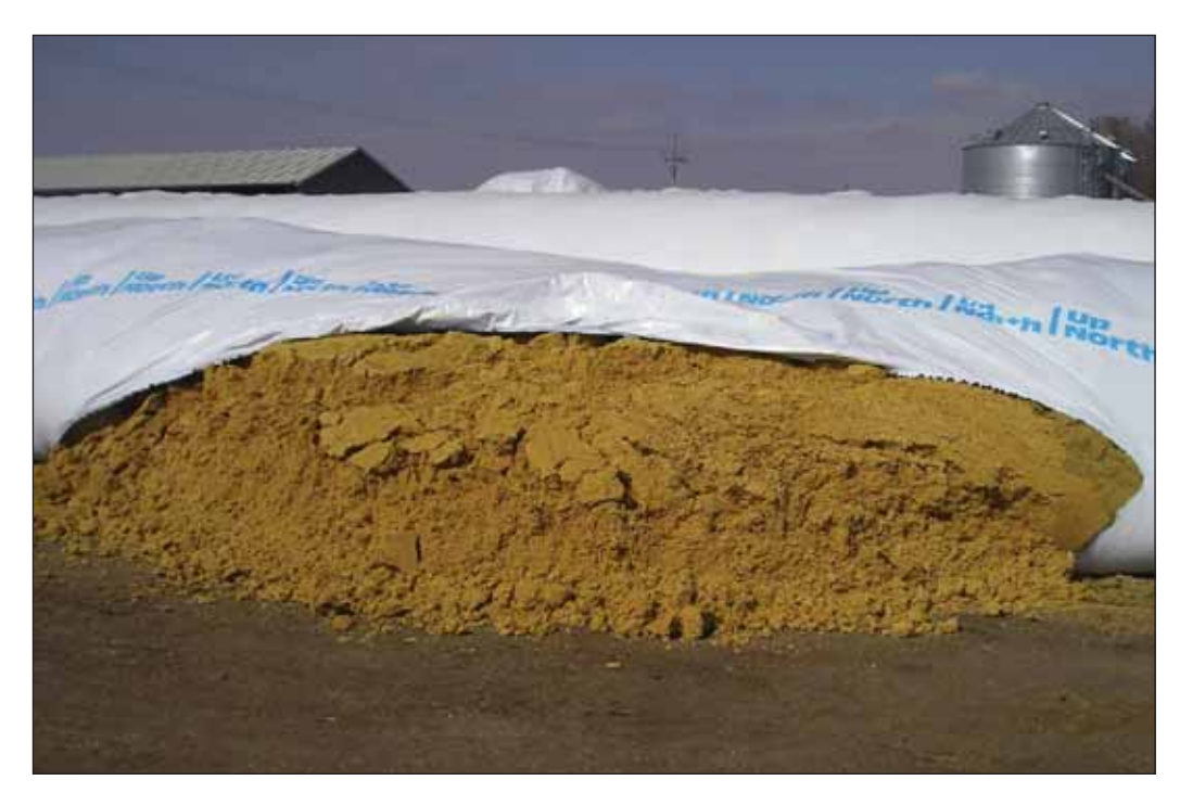
Figure 4. Consequence of bagging straight WDGS under pressure (300 psi) or without enough forage or other bulking agents to allow for pressure during bagging.

To determine the amount of feeds to weigh out, producers need to accurately account for the mixture needed on a DM basis, and then calculate the as-is percentages so that feeds can be weighed out. This process is similar to combining feeds at the time of feeding into mixing equipment. With wetter feeds such as WDGS, the as-is percent inclusion of forage is significantly less than the mixture on a DM basis.