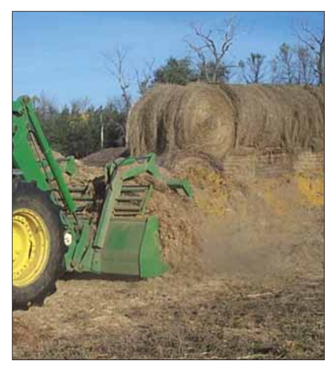
Figure 11. Mixing of grass hay and modified WDGS at a ranch using a front-end loader. The modified WDGS was unloaded on the ground with hay in layers and pushed together with a front-end loader. For cow-calf producers, this may be mixed enough to ensure proper storage and still be adequately mixed for feeding.

First, the forages need to be ground or at least a sufficient particle size to adequately mix with WDGS.