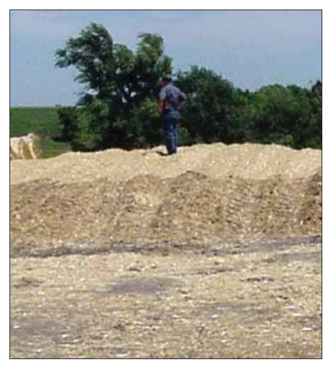
Figure 8. Cow-calf producer with a mixture of 20% wheat straw and 80% WDGS (as-is basis), which is 38-40% wheat straw on a DM basis.